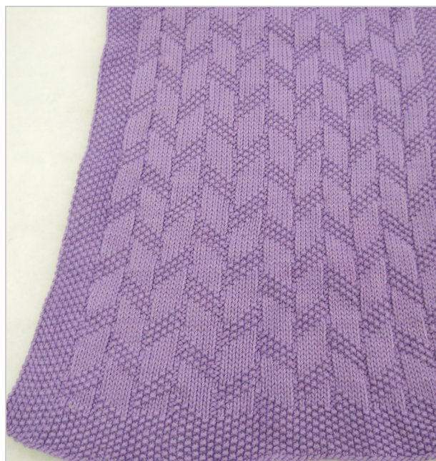
NEWTON'S YARN COUNTRY PANDA SCARF www.newtons.com